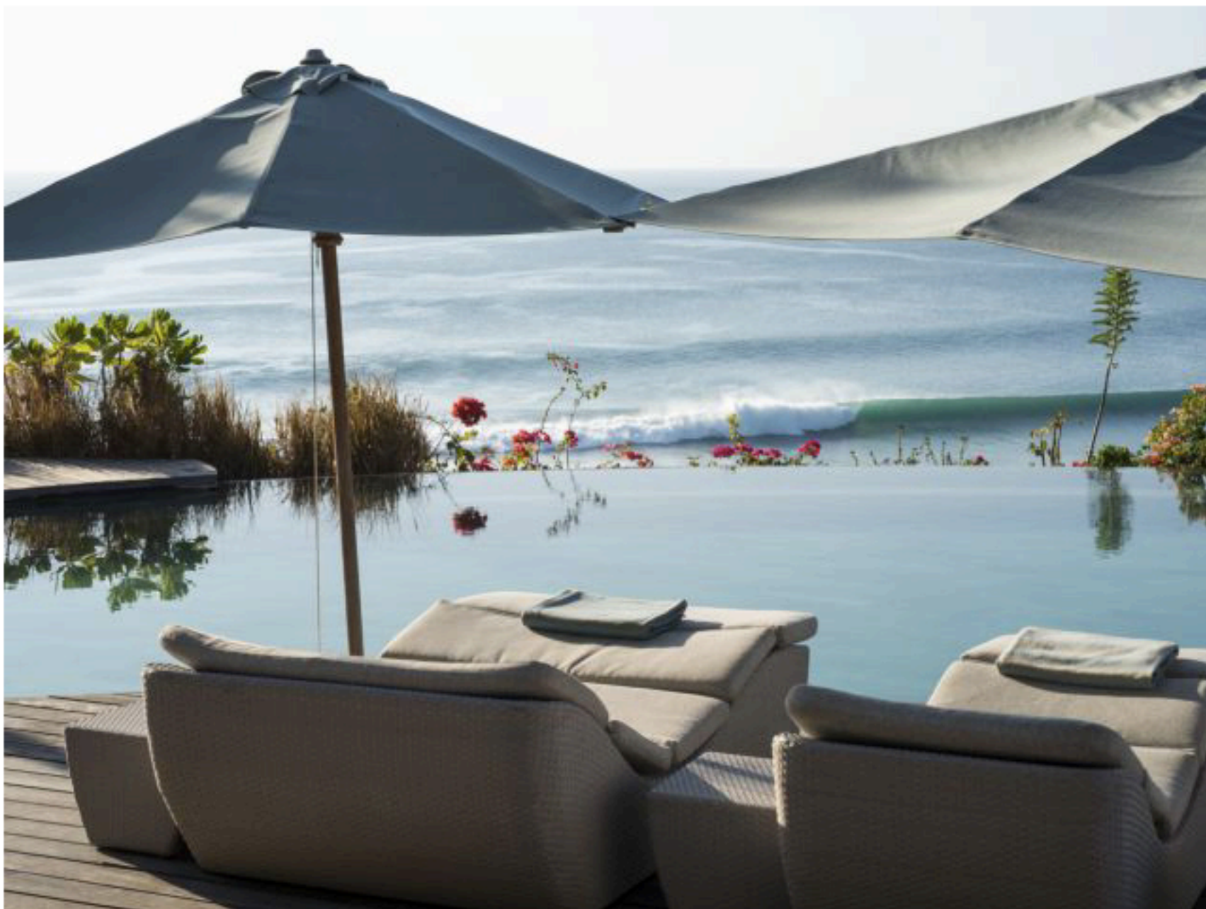
Watch the surf from the pool or lounge bar at Suarga Padang Padang by Peppers

When luxurious, sustainable design with intelligence and heart is perched above one of Bali's most beautiful Bukit beaches... Meet the inspiring new boutique resort with a passion for making a difference